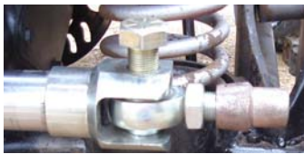
Left hand threads

Install provided rod end w/ jam nut and threaded insert into the clevis (left hand) and high steer arm (right hand). Leave approx. 3/8" of thread exposed for adjustment.