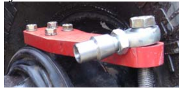
right hand thread

Measure between threaded insert "shoulders", both sides should be equal if the toe is properly set. Cut provided tubing pieces, to length, for both sides. (Approx. 8")