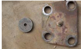
spacer shown w/ top plate for size comparison

Install high steer arms with new bolts & lock washers provided . Torque to 130-140 ft/lb.